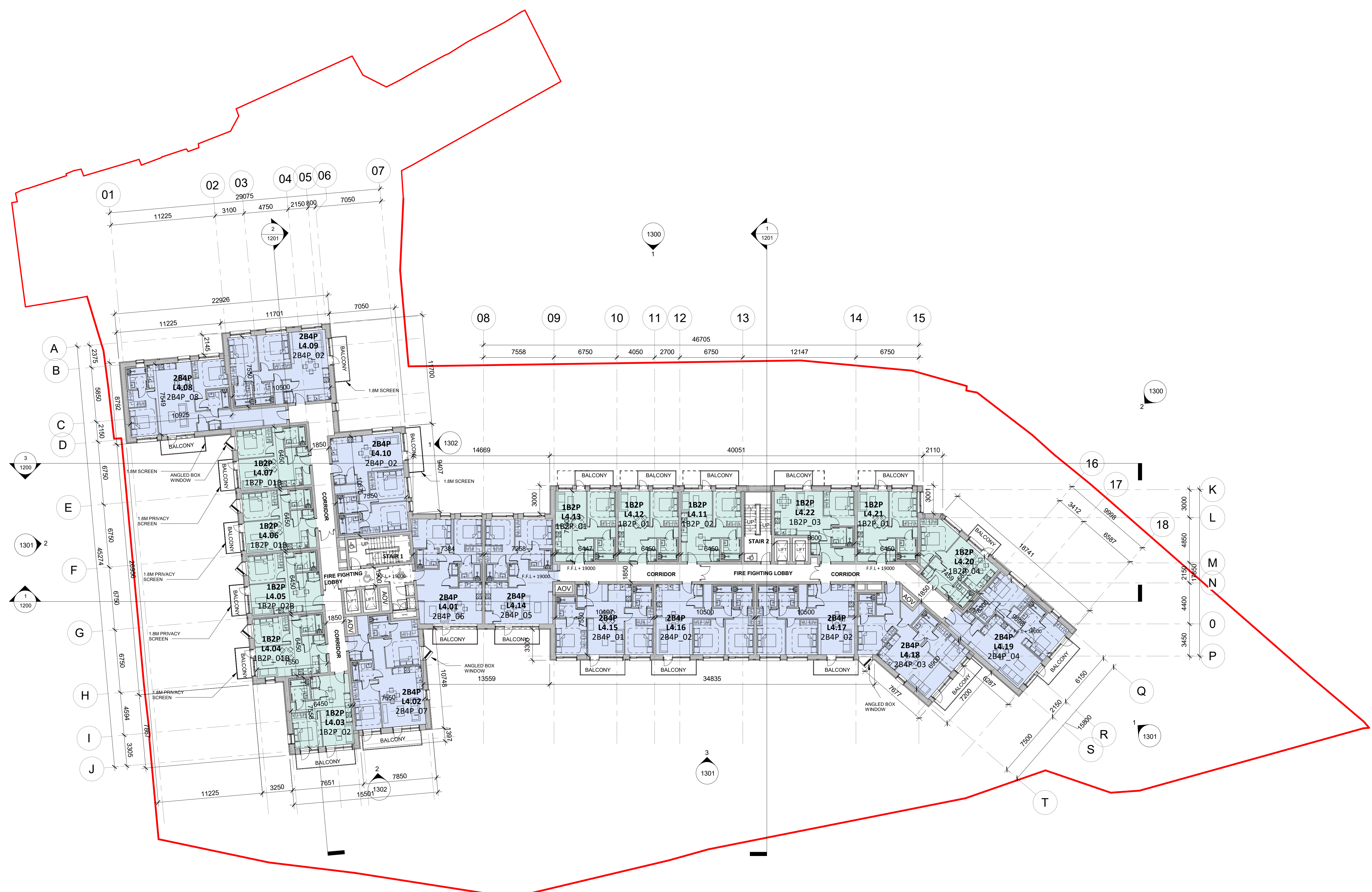
1 1104_Fourth Floor Level - GA 1 : 200

Refer to drawing series A-1500 for detailed unit plans